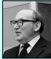
Maurice Wilkes, 1913-2010

“As soon as we started programming, we found to our surprise that it wasn’t as easy to get programs right as we had thought. Debugging had to be discovered. I can remember the exact instant when I realized that a large part of my life from then on was going to be spent in finding mistakes in my own programs.”