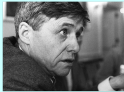
Ken Iverson (1920-2004)